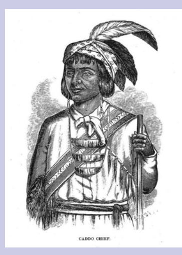
Caddo Chief, from a Pictorial History of Texas .

By the early 1840s, all Caddo groups had moved to the Brazos River area to escape colonization efforts. They remained there until they were placed on the Brazos Indian Reservation in 1855, and then in 1859 the Caddos were removed to the Washita River in Indian Territory by the superintendent of Indian affairs in Texas. During the American Civil War, the Caddo abandoned the reservation and moved to southern and eastern Kansas but return to their reservation by 1867. By 1874 the Caddo reservation's boundaries were defined and the separate Caddo tribes unified.