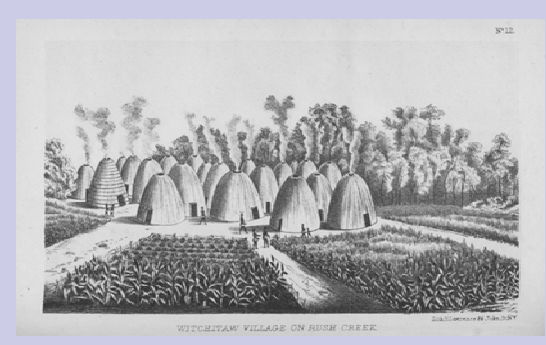
Wichita Village, from Exploration of the Red River, 1852

Wichita influence on Texas is found in the name of a river, a county, and the city of Wichita Falls.