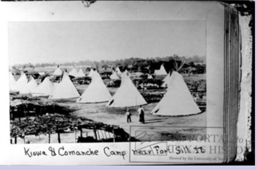
Kiowa & Comanche Camp near Ft. Sill in Indian Territory (Oklahoma), c. 1890.