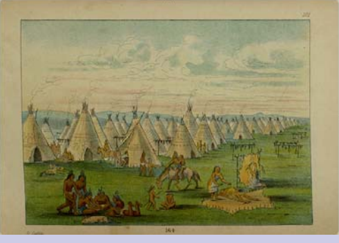
Comanche Village, from George Catlin's North American Indians.

After Texas joined the United States, the Federal government attempted to negotiated a peace treaty, and establish a reservation for the Comanche, but this failed. Several offensives were launched by the Texas Rangers in the late 1850s, assisted by the U.S. Army. During the American Civil War, the only offensive was conducted by "Kit" Carson, at the battle of Adobe Falls. In the Post Civil War period, new offenses were launched. By the 1870s the last Comanche and Kiowa uprising, lead by Quanah Parker was ended by the Red River war of 1874-75. In 1875, the Comanches began reservation life in Oklahoma.