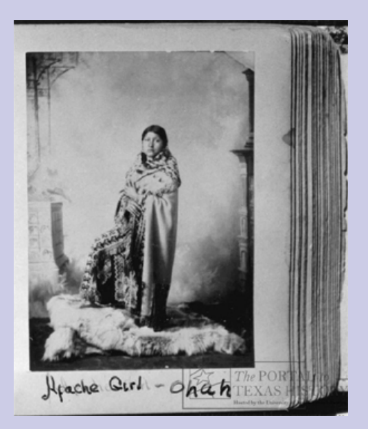
Ohah, Apache girl, c. 1890.