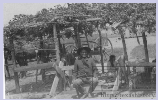
Chief Geronimo, 1899.

Over the decades the Apaches were eventually defeated and forced onto reservations. The last Apache resistance lead by Geronimo was forced back onto the reservation in 1884. He revolted again and was forced back onto the reservation in 1886. He escaped and was captured for the final time in Skeleton Canyon in 1886 where the Apache wars began 25 years earlier.