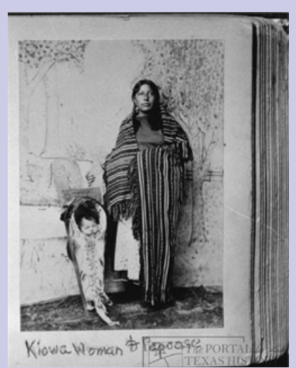
Kiowa Woman and papoose, c. 1890.